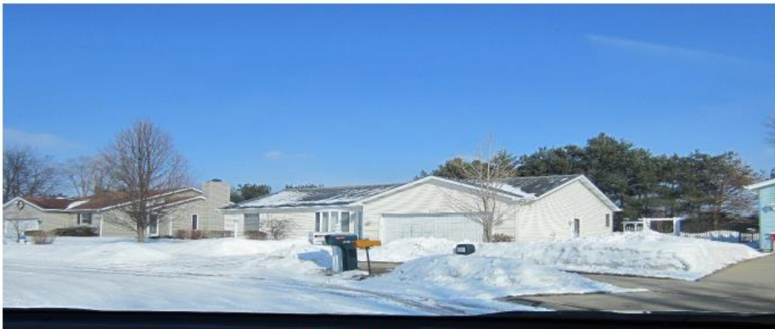
A typical NEW YEARS DAY as we remember them!