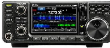
Prizes like these and hundreds of others have been given away since our first HamFest!