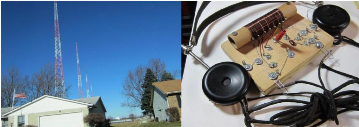
FOR EXPLANATION OF THESE PHOTOS SEE CRYSTAL SET STORY AT END OF THIS REPORT.

The weather temperatures have been like the proverbial roller coaster – up, then down – but generally it seems this winter has been milder than normal – so far! Also, it seems that contrary to the usual, you folks in central and southern Indiana have gotten a bit more snow and ice than we northerners. As for QIN, our net control assignments have stabilized and net participation has improved. The traffic count is down a bit from last month, but that’s not uncommon for the month following the Christmas and New Year holidays. I thank you all for supporting QIN!